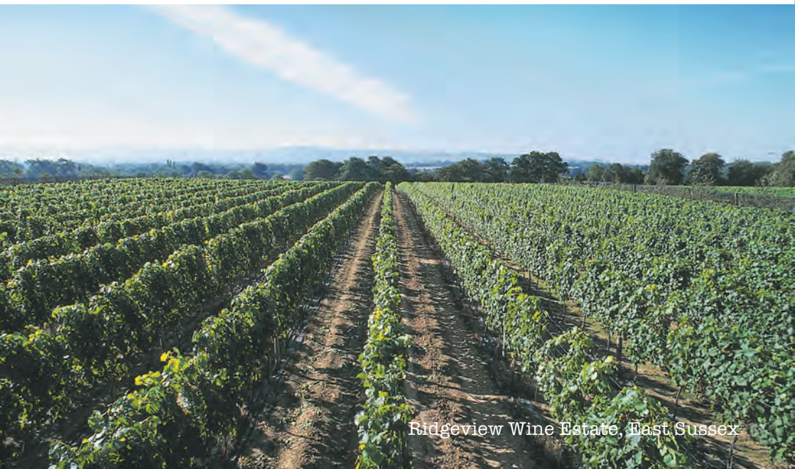
Ridgeview Wine Estate, East Sussex

Wine tourism is popular the world over. The appeal of visiting a wine region reaches out to a wide audience. No longer is it the bastion of the hardened wine geeks - wine offers a chance to discover more about a region's culture, food and landscape; it brings people together and provides a rich and pleasurable experience, whether they have an in-depth knowledge or just enjoy a tipple.