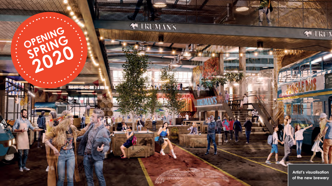
Artist's visualisation of the new brewery